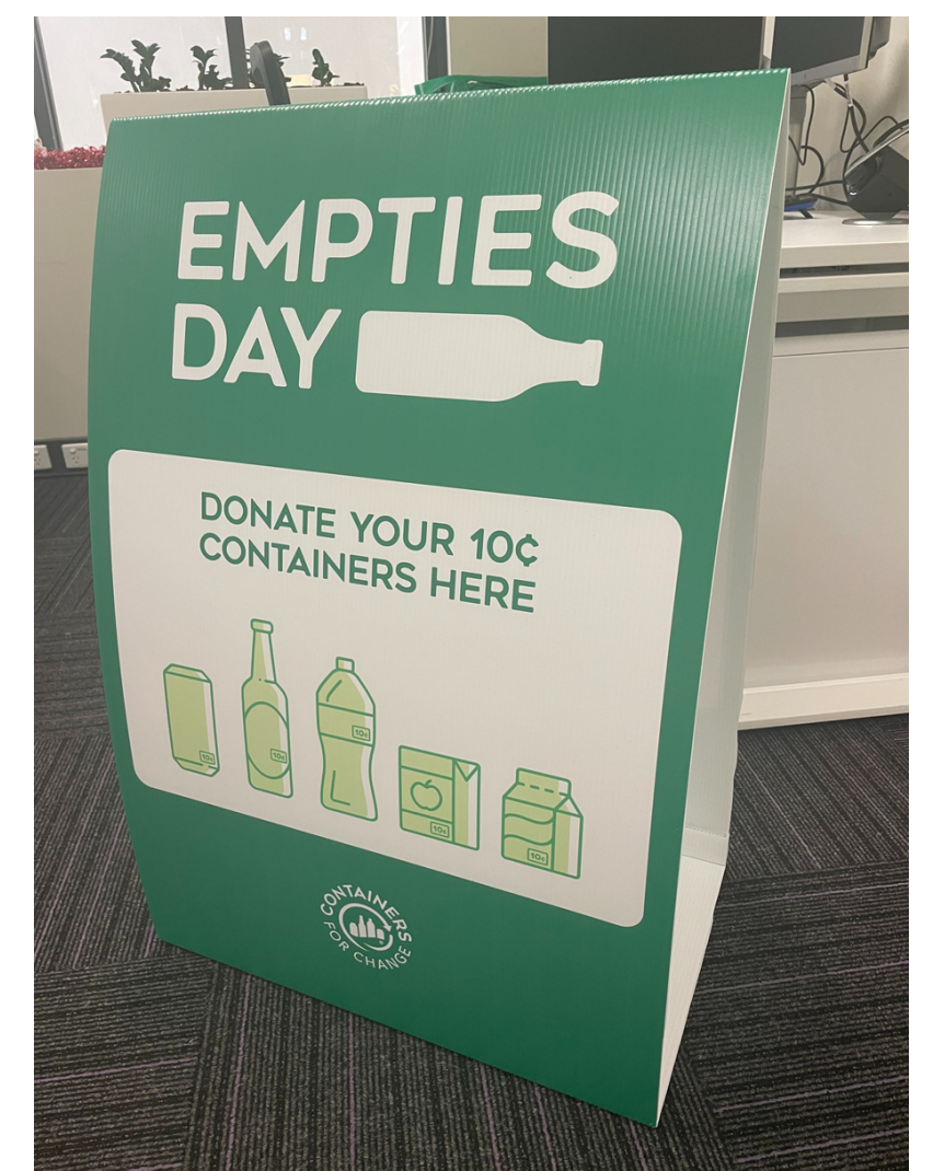
Empties Day Corflute To be displayed at all times