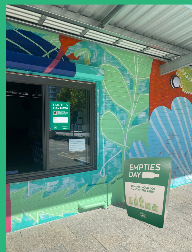
On the path to the refund window/machine