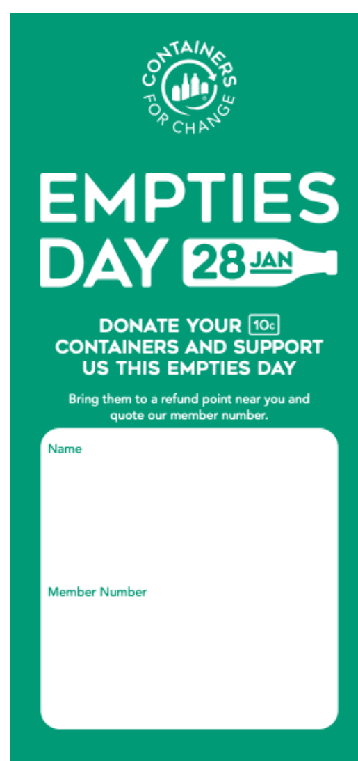
Donate DL Flyer If needed, you can supply these to your community/charity groups