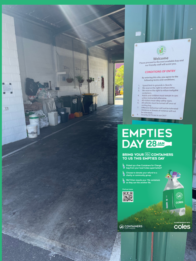
On the customer's journey through the depot (e.g. as they are waiting to drive through)