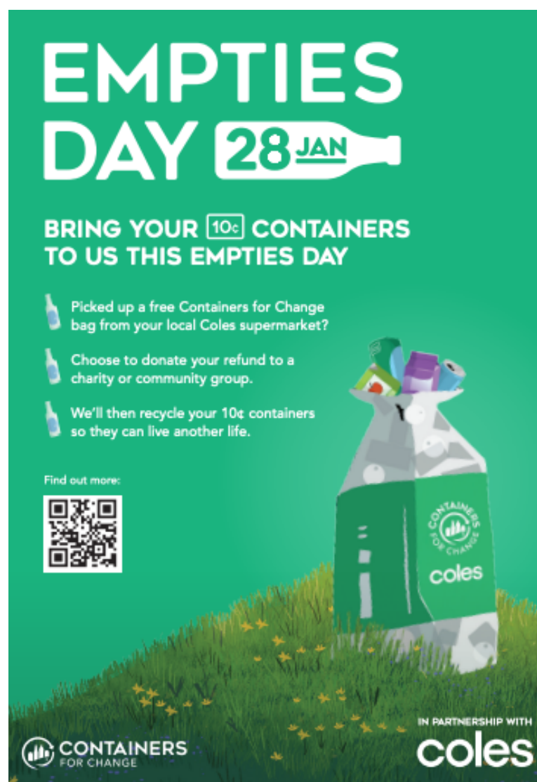
Empties Day Awareness Poster Displayed from Friday 9 December until Coles bags run out. We will send a communication at this time