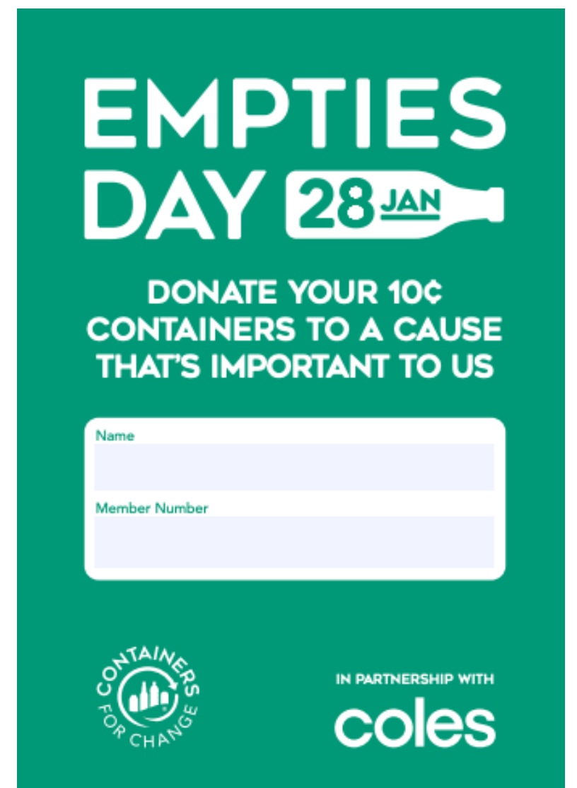
BAG DROP/Donation bin A3 Poster Only to be used at bag drops, can be displayed at all times