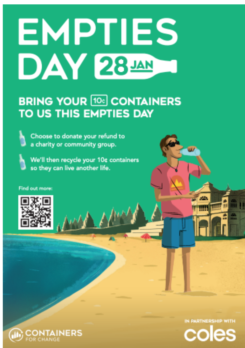
Generic Empties Day Poster Displayed at all times