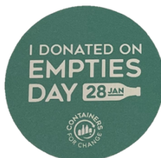
I donated on Empties Day Sticker To be handed out to customers on Empties Day after they donate their containers